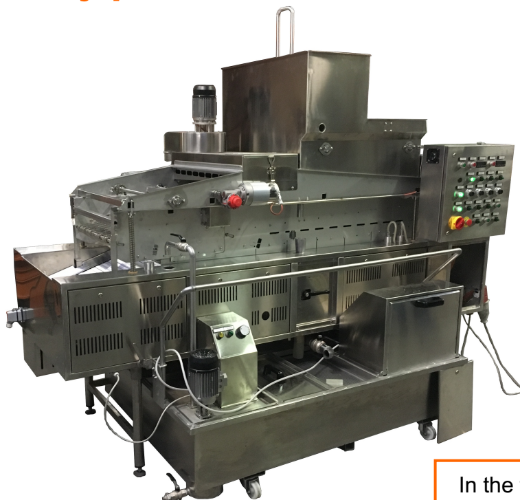
In the figure Model G-2460